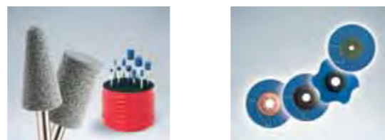
with over 4000 products currently available

LUKAS S.A. (PTY) LTD P.O. BOX 800, GERMISTON, 1400 SOUTH AFRICA 1288 HARRIET AVENUE, DRIEHOEK, GERMISTON Tel: 011 825 1550 Fax: 011 872 0144 (Admin) 011 873 8970 (Accounts) 0800 219 219 (Sales) E-mail: abrasives@lukas.co.za Web: www.lukas.co.za