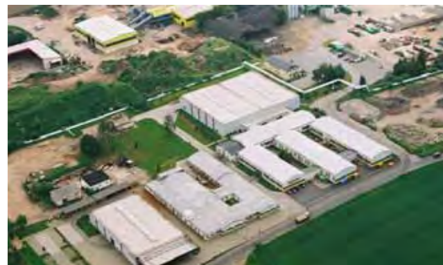
Rottluff factory based in, Chemnitz Germany